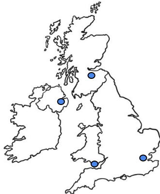
Map of the UK

4. What direction would you travel to get to Scotland? How do you know?