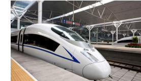
High speed trains